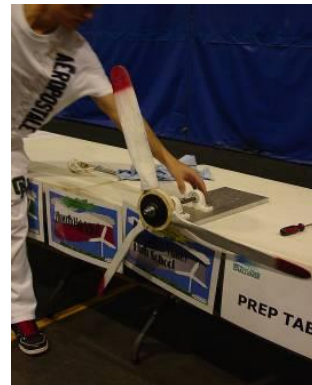
Figure 5: Prep area