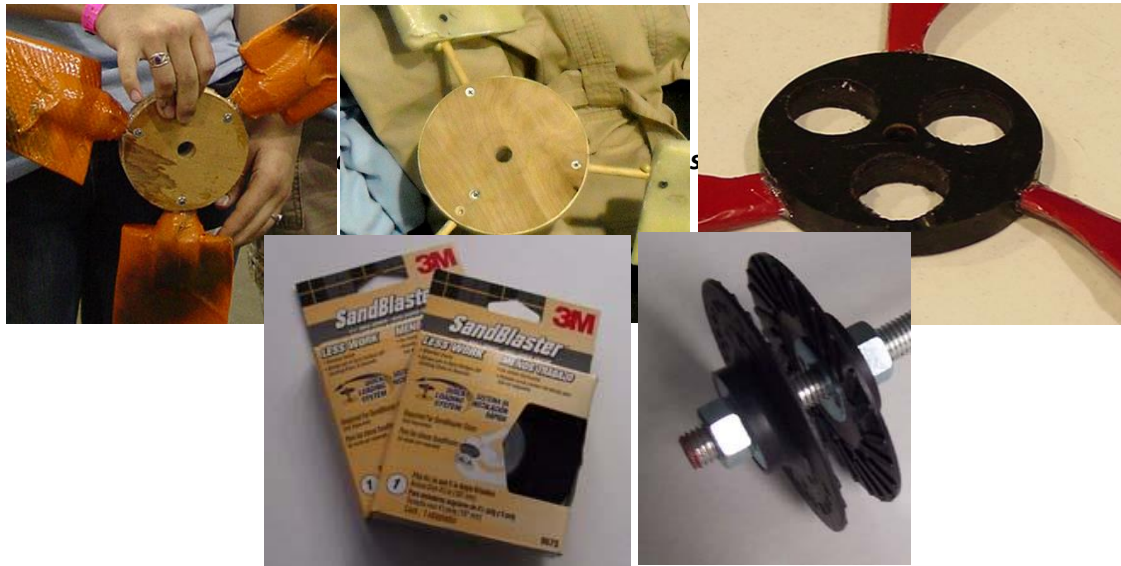
Figure 2: Hub attachment plates

The mounting system on the testing platform consists of two 4 ½" plates with a 5/8" threaded center hole , threaded on a 5/8" threaded rod and locked with locking nuts, shown in Figure 2. Each team's center hub will be sandwiched between the two plates as shown in Figure 3. Your turbine will need to have a hub with flat faces on the front and rear surface with a clear area greater than 4 ½" and with a 5/8" hole in the center. It is important that no part of the blades or fastenings interfere with the two testing platform clamping plates, i.e. these items must be clear of a 4 ¼ diameter circle as shown in Figure 4.